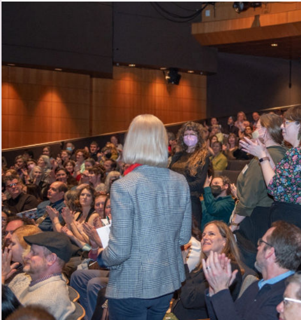
Oregon Literary Fellowship recipients receive a round of applause from the audience at the 2024 Oregon Book Awards Ceremony