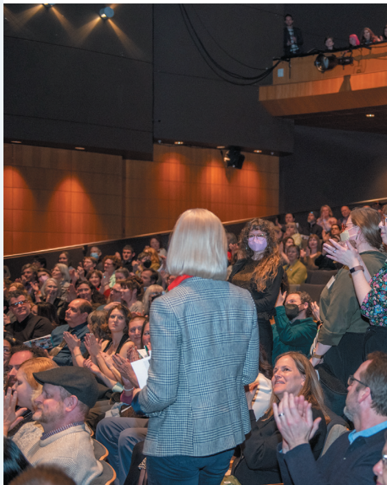
Oregon Literary Fellowship recipients receive a round of applause from the audience at the 2024 Oregon Book Awards Ceremony