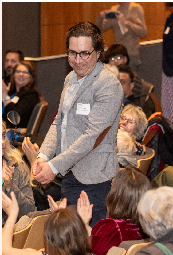
Oregon Literary Fellowship recipients receive a round of applause from the audience at the 2026 Oregon Book Awards Ceremony